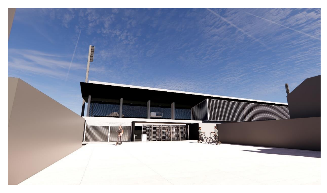
Artist impression: West stand entrance, view taken from St Peters Road looking East.