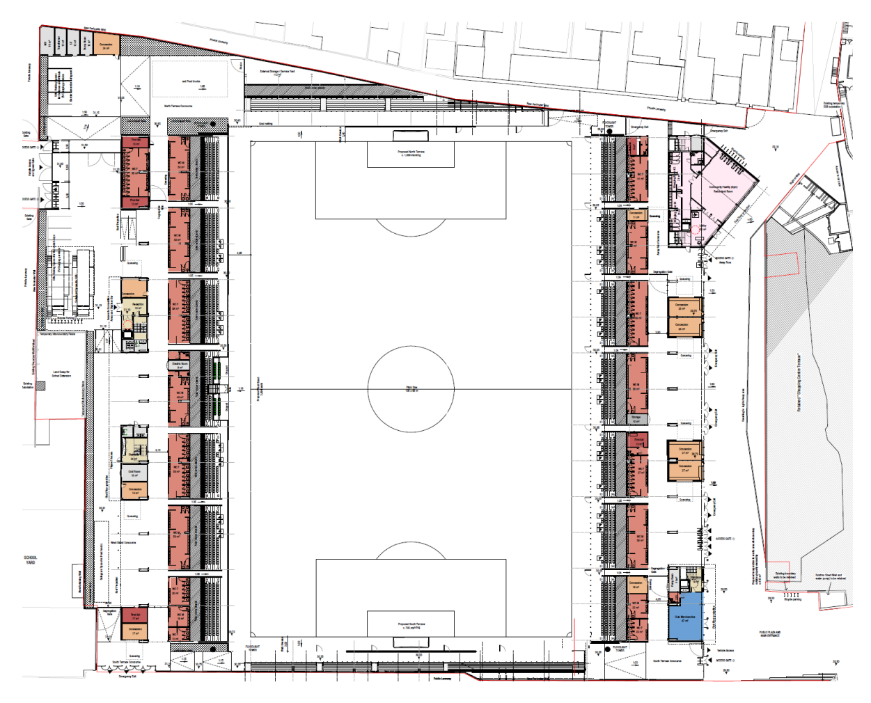
General Ground floor plan, showing concourses, and spectator facilities under stands, Community centre building located in top right corner.

The project will allow for community engagement, in particular with the outreach programmes organised by Bohemians Football club, as well as the provision of new facilities for local residents to utilise.