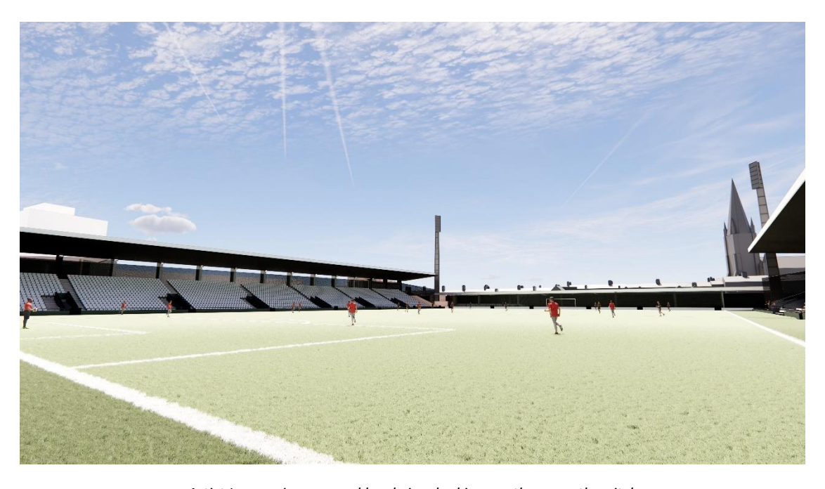
Artist Impression: ground level view looking south across the pitch