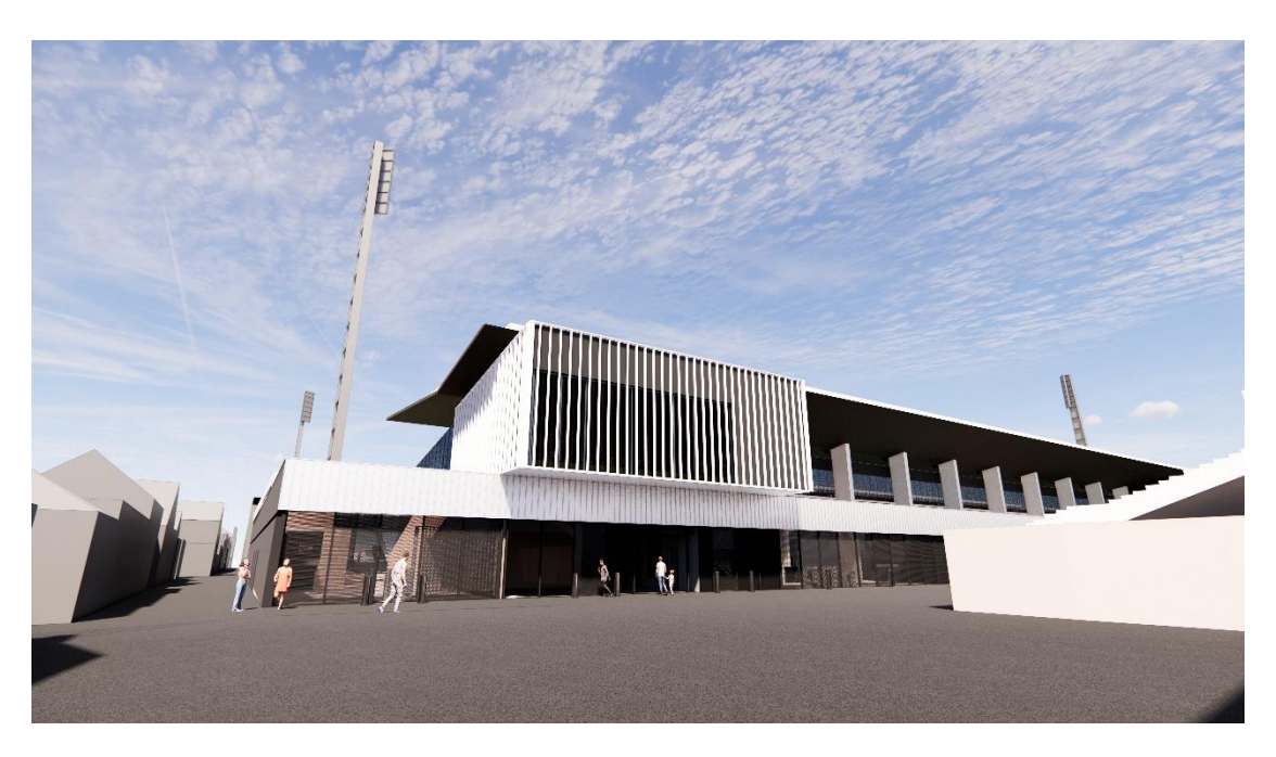
Artist Impression: looking west at the new East Stand, with the club shop and offices in the centre