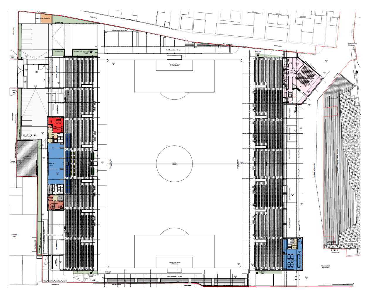
General\ plan\ showing\ the\ main\ stands\ seating\ (east+west)\ and\ standing\ areas\ (north+South).